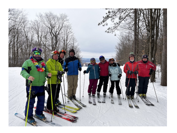
Top of the hill at Greek Peak.