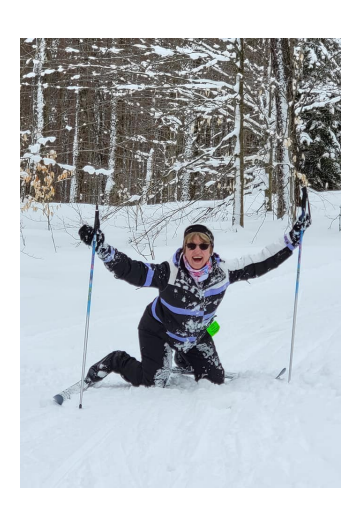
Oops! How do I get up?