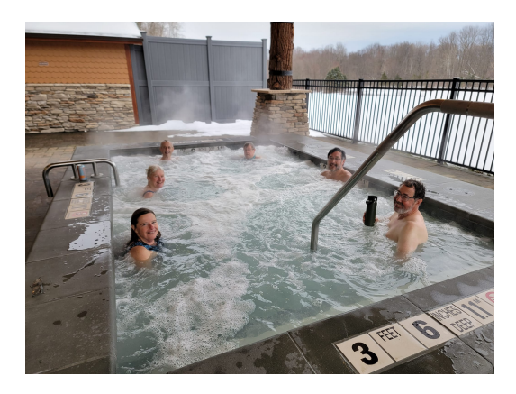
There's plenty of room in the hot tub at Tailwater.