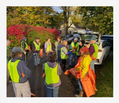
Adopt A Highway: "Who's here?" "You go left ..no, right." "Is that east or west?" "Which side of the road?"