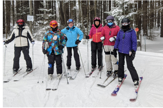
Top to bottom: Scenes from Whiteface, Holiday Valley, Ely Park, Topsy Elves in VT, Belleayre Overlook Lodge, sign at HV, Belleayre gondola, Camelback water slides, Mt. Snow, Whiteface, Mt. Snow glades.

TCSCers enjoyed alpine, cross country skiing and snowshoeing in great conditions in February. Some of the places visited included Belleayre, Whiteface, Mt. Snow, Holiday Valley, Camelback, Elk Mountain and Greek Peak, as well as Ely Park Golf Course, Greenwood Park and Chenango Valley State Park. Jill Darling skied the length and breadth of Vermont.